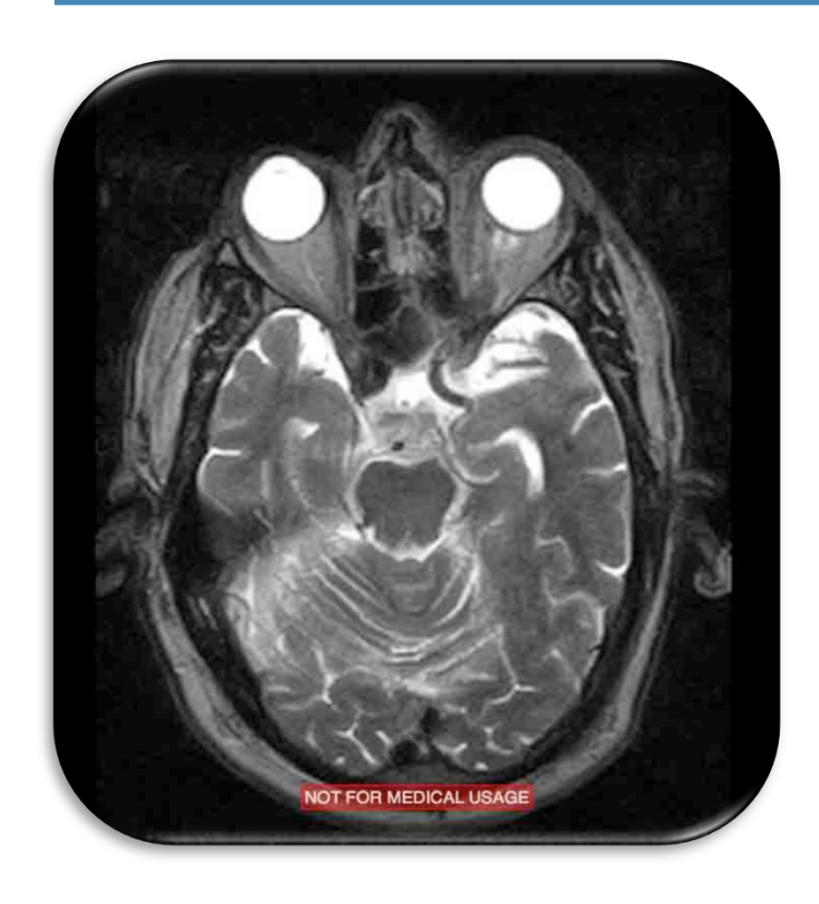
Hitachi Airis II .3T Open