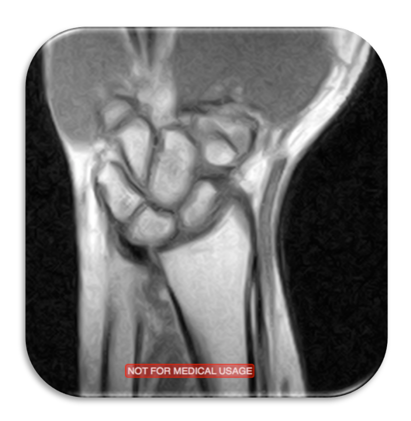
Hitachi Airis II .3T Open