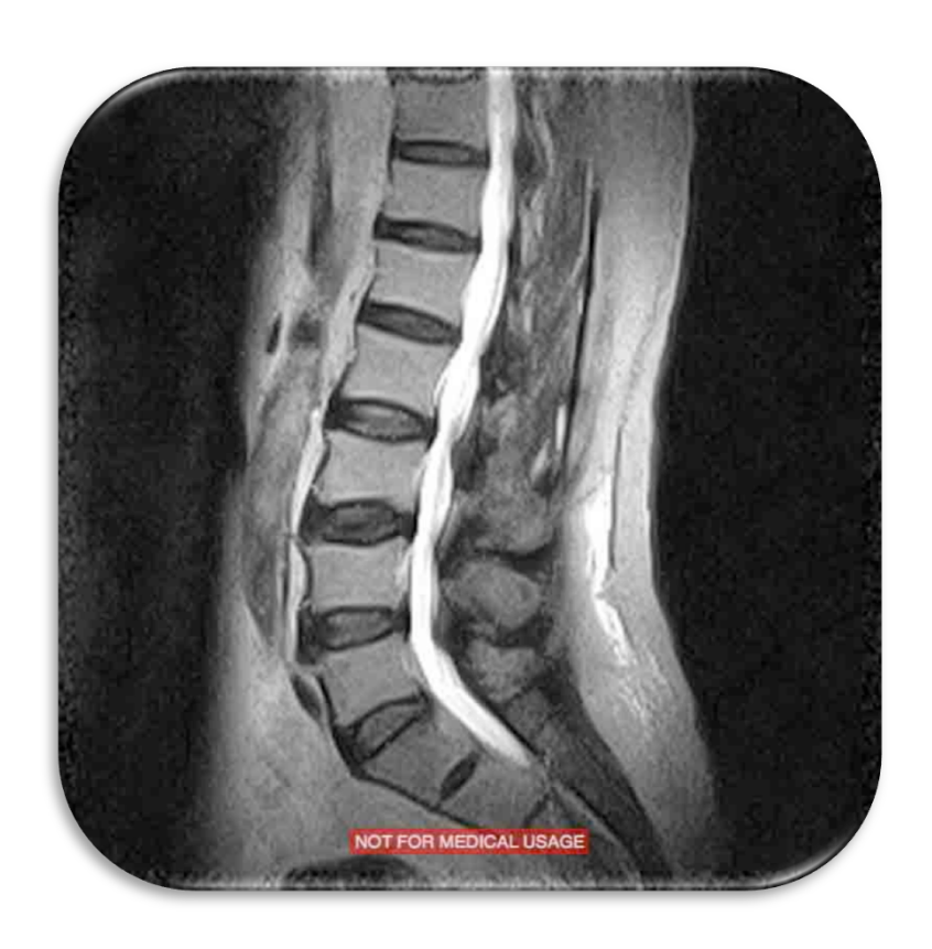
Hitachi Airis II .3T Open