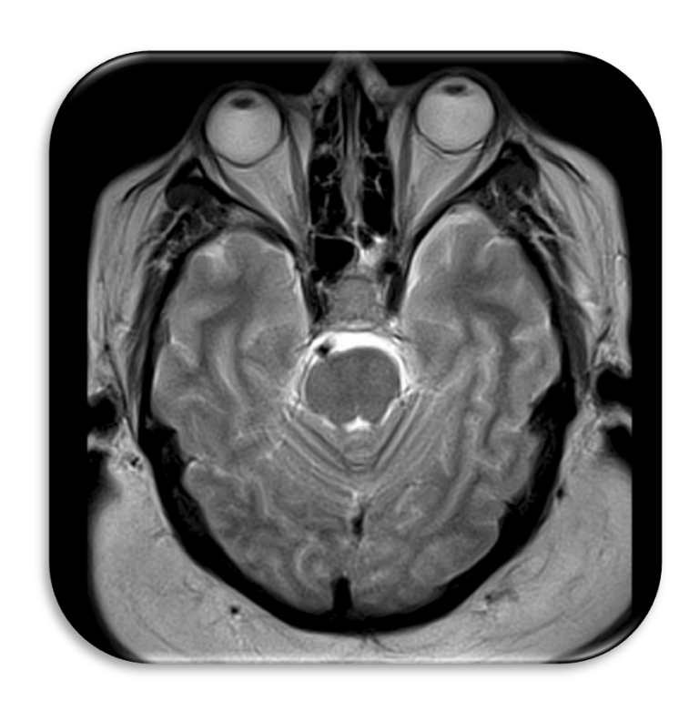
Siemens MAGNETOM Espree 1.5T Open Bore