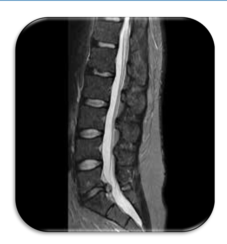
Siemens MAGNETOM Espree 1.5T Open Bore