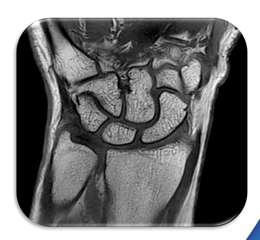
Siemens MAGNETOM Espree 1.5T Open Bore